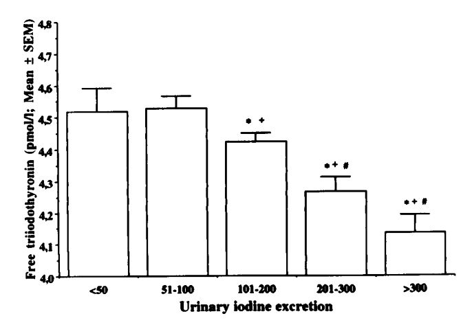
FIG. 3. Free triiodothyronine (FT<sub>3</sub>) levels of 2308 untreated euthyroid patients (means \pm SEM). In the groups with lower iodine excretion compensatory higher FT<sub>3</sub> levels were observed. *, significant difference compared with group A (p < .0); †, significant difference compared with group B (p < .05); #, significant difference compared to group C (p < .05).

with goiter. Tg values in patients with uninodular and multinodular goiter were significantly higher than in patient groups with normal sized thyroid glands or diffuse thyroid enlargement (Table 1).