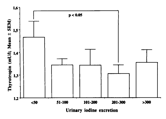
FIG. 1. Means \pm SEM of thyrotropin levels of 2308 untreated euthyroid patients sorted according to their iodine excretion. Lowest TSH values could be observed in the group with iodine excretion between 201 and 300 \mu g iodine per gram creatinine (p < .05 compared with group A).

The results are given as means \pm standard error of the mean. To compute the significance of FT<sub>3</sub>, FT<sub>4</sub>, TSH, Tg