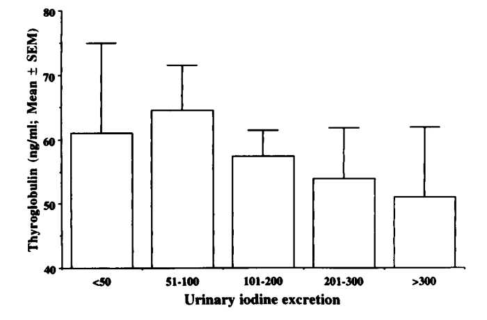
FIG. 2. Means \pm SEM of thyroglobulin levels of 1050 untreated euthyroid patients sorted according to their iodine excretion. Decreasing thyroglobulin values could be observed with increasing urinary iodine excretion.

levels and age between the groups an ANOVA analysis was applied (Fisher least significant difference). The level of significance is taken to be 95%. To study the cross-classification of iodine excretion, Tg, and goiter grade the chi squared test was applied. Correlation between TSH and age was determined with Spearman's rank correlation test.